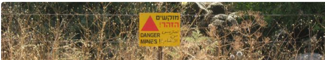
used under a Creative Commons license.

Write to international travel companies such as Airbnb, Booking.com, eDreams, Expedia, and Lonely Planet that misrepresent the occupied Syrian Golan as part of Israel and promote accommodation and tourist activities in illegal Israeli settlements. Tell them that this misrepresentation is false advertising and violates consumers' rights. Request that these companies comply with international human rights and humanitarian law standards and stop promoting accommodation and tourism in illegal Israeli settlements.